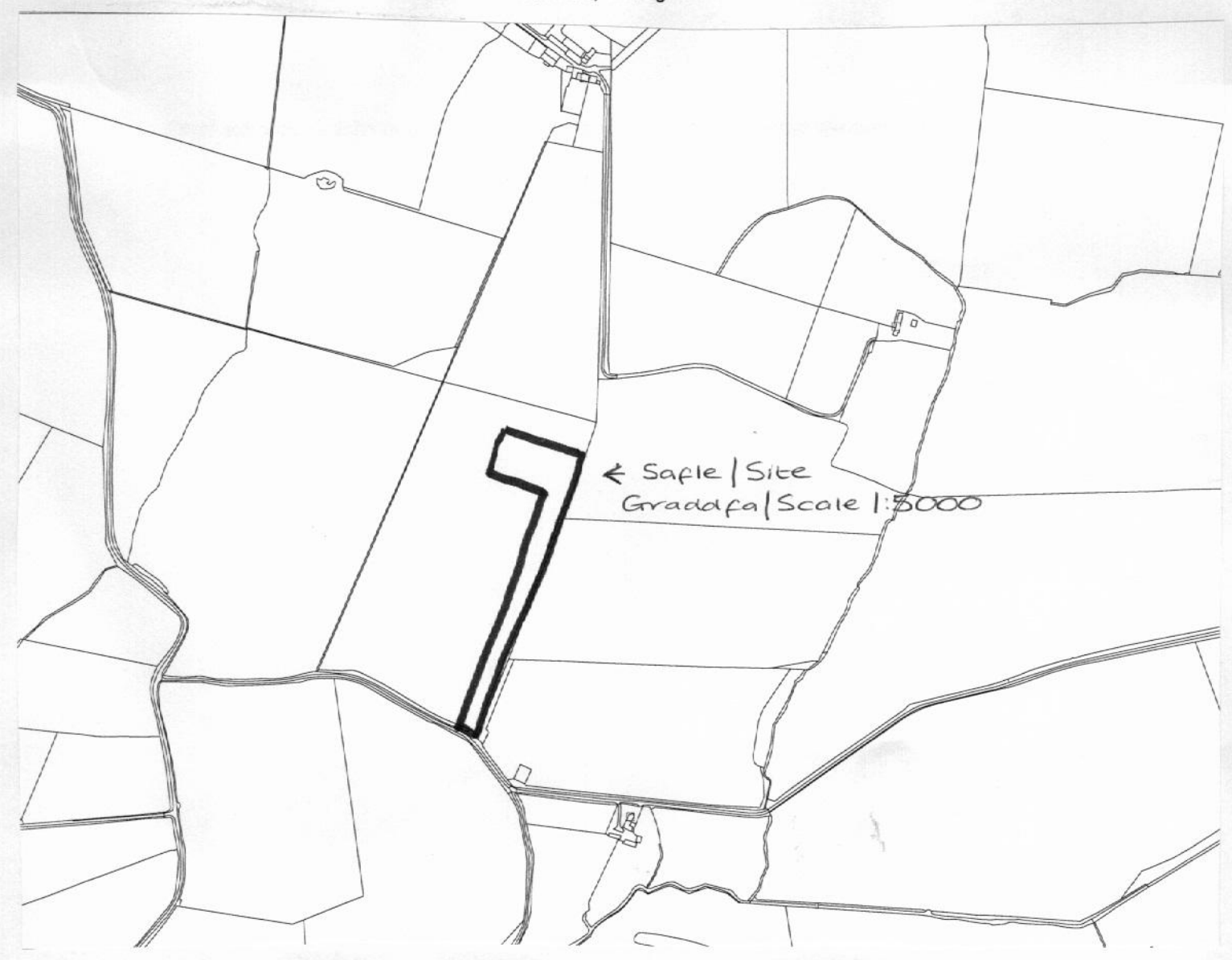
Tai Hen, Rhosgoch

Full application for the erection of one wind turbine with a maximum hub height of up to 44m, rotor diameter of up to 56m and a maximum upright vertical tip height of up to 72m together with the erection of a transformer station, utility housing and new access track and hardstanding on land at